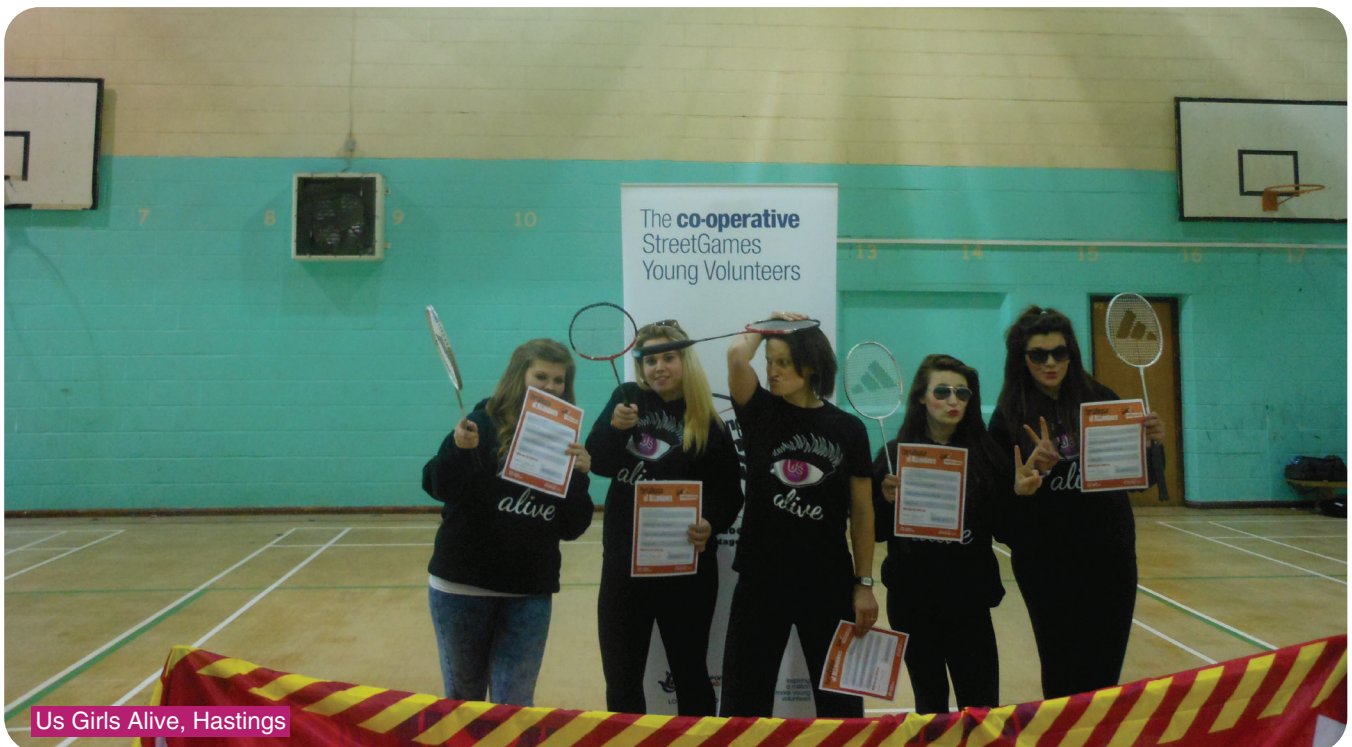
Us Girls Alive, Hastings