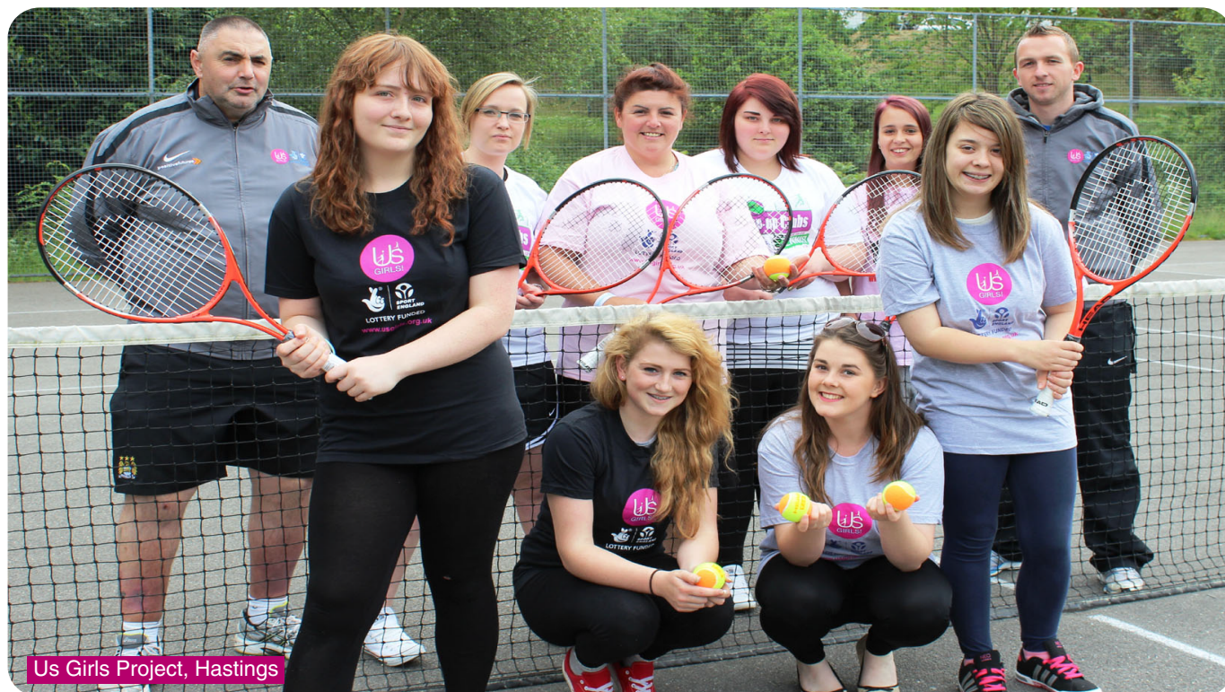
Us Girls Project, Hastings