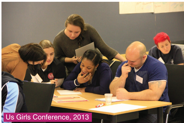
Us Girls Conference, 2013